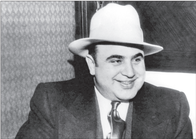
Notorious bootlegger Al Capone was not only the "Boss of Booze," he was also the first boss of one of Catalina's Island's most colorful seaplane pilots—Bob Hanley.