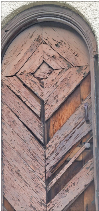
The Chimes Tower door has seen better days.