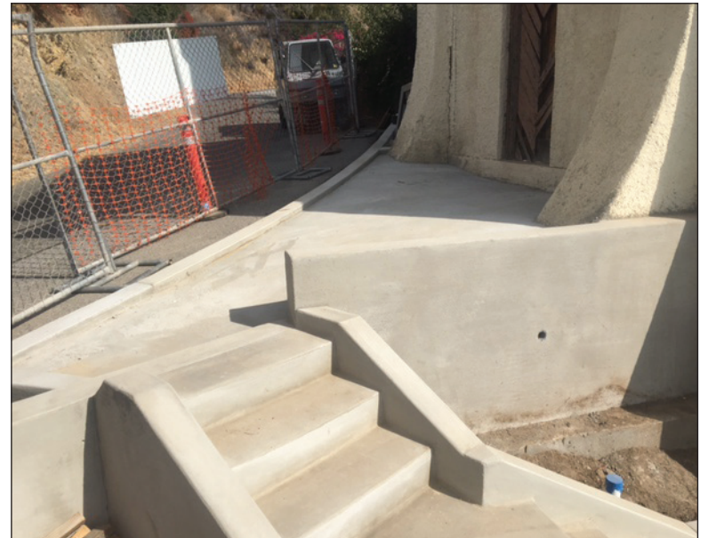
The steps leading to the mechanical room of the Chimes Tower have been repaired and the concrete for the flagstone entrance has been poured.