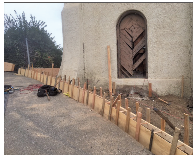
The Catalina Chimes Tower Foundation plans to repair the Chimes Tower and the chimes within it. The Chimes Tower was commissioned by William Wrigley Jr. in 1925.