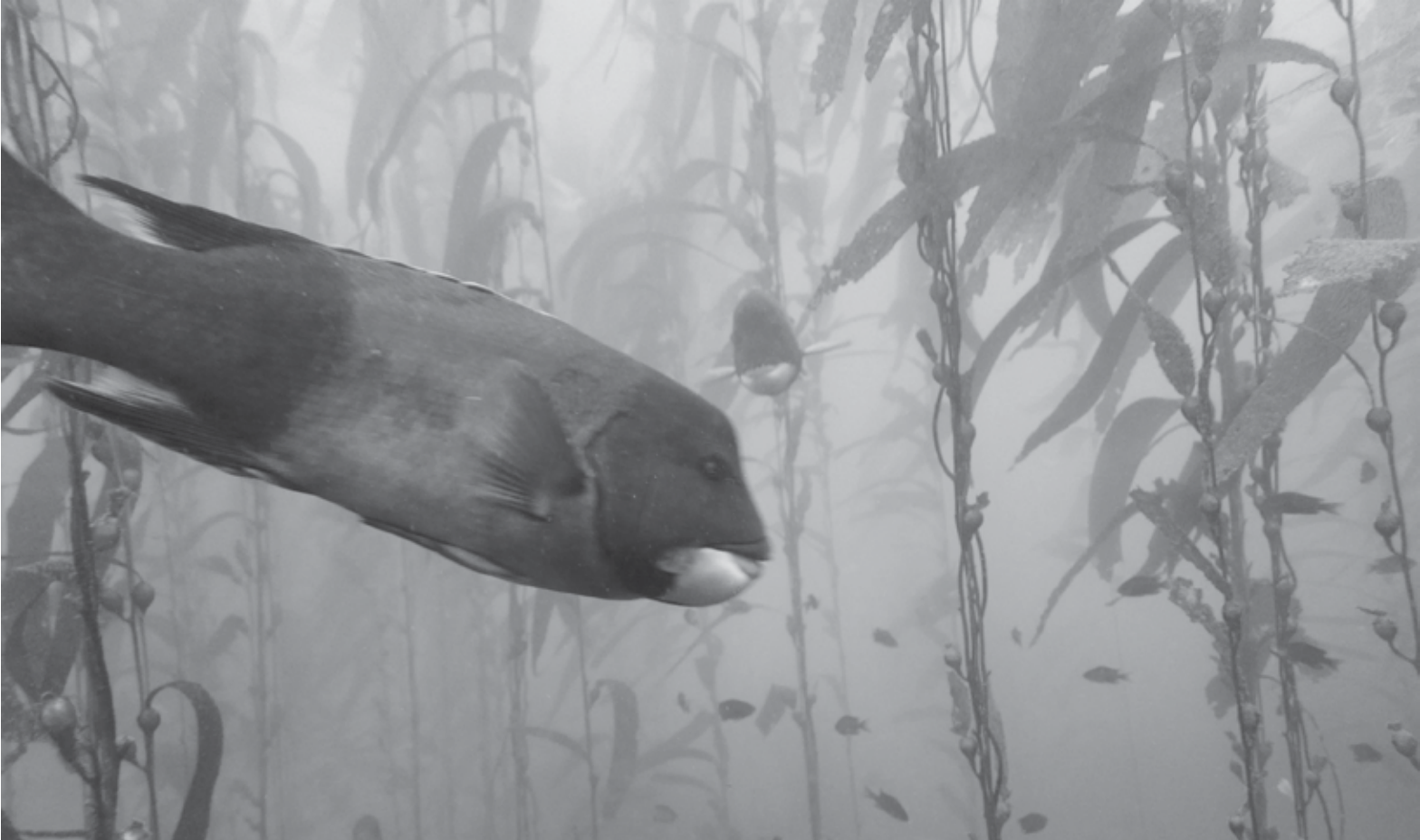
A male California sheephead makes his rounds within the kelp forrest .